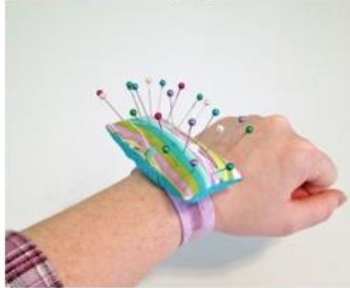
Pin Cushion Wristlet, by Dianna Blackmer

Supplies Needed for Pincushion, 2.5" x 8.5" :