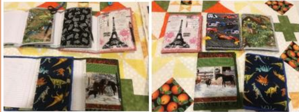
Quilted Notebook Cover, by Emily Mickelwait

Here are the supplies listed for the Quilted Composition Book Cover which fits a standard size composition notebook of 9.75" x 7.5":